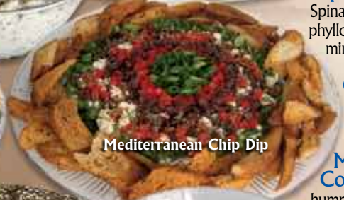
Mediterranean Chip Dip