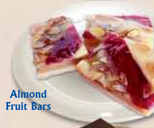
Almond Fruit Bars