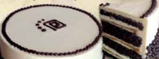
Bailey's Irish Cream Cake