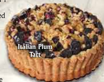
Italian Plum Tart

Italian Plum Tart Nutty crust filled with frangipane and Italian plums. A wonderful winter treat. Order early! $26 Srvs. 8