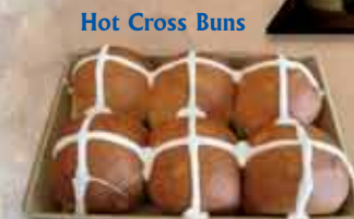
Hot Cross Buns

Wonderful citrus flavors mingle with the mystical and aromatic Greek spice called mahleb to create a unique sweet bread. Perfect for breakfast or with afternoon tea or coffee.