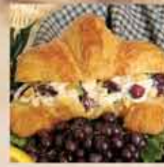
Best Chicken Salad