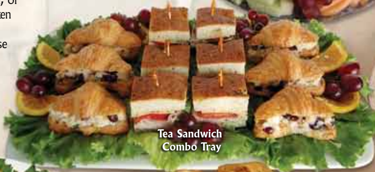
Tea Sandwich Combo Tray