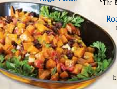
Sweet Potato Salad

Roasted Red Potato Salad Roasted red potatoes, red peppers, and sautéed onions provide a delicious flavor to our reinvented potato salad. Lg. $39 Sm. $22