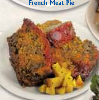
French Meat Pie