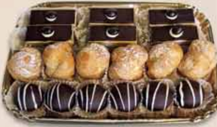
Dessert Sampler (Opera Cake, Paris Petits, Rumballs)