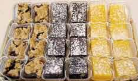
Assorted Bars Tray