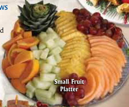
Small Fruit Platter