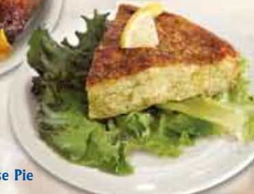
Leek & Cheese Pie