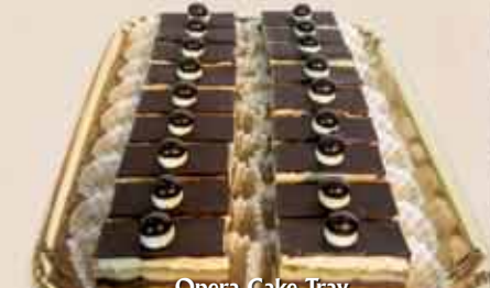
Opera Cake Tray