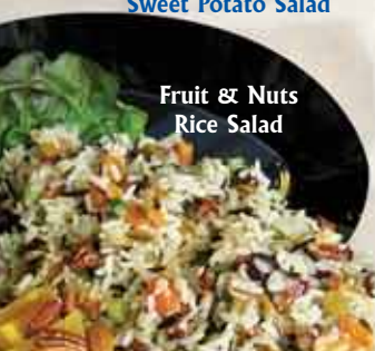
Fruit & Nuts Rice Salad

Tortellini Salad Cheese tortellini, artichokes, feta, Kalamata olives and a balsamic dressing. Lg. $56 Sm. $29