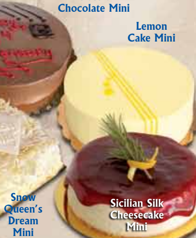
Snow Queen's Dream Mini