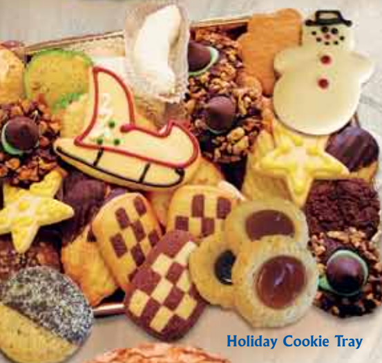
Holiday Cookie Tray

Holiday Cookie Tray Beautiful, flavorful assortment of carefully handmade European and traditional holiday favorites, including Chocolate Truffles, Sandbisson, Italian Jelly Cookies, Swedish Ginger Thins, Pistachio/Cherry Snowballs, Checkerboards, Coconut Crisps, Orange Finger Cookies and Decorated Cut-outs. Lg. $39 5 doz. Med. $29 3 doz. Sm. Box $19 2 doz.