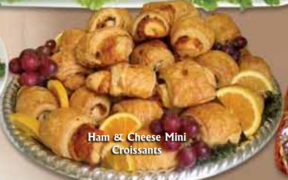
Ham & Cheese Mini Croissants