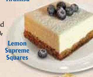
Lemon Supreme Squares