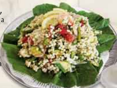
Shrimp with Couscous