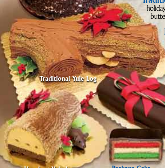
Traditional Yule Log

Traditional Yule Log Our Bûche de Noël is decorated with holiday gumpaste poinsettias. Inside, chocolate cake and chocolate buttercream rolled around a marzipan center. $46 Serves 24