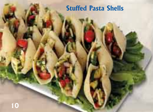
Stuffed Pasta Shells

Beef Canapés Roast beef with a zesty spread, Parmesan & arugula. $21/doz.