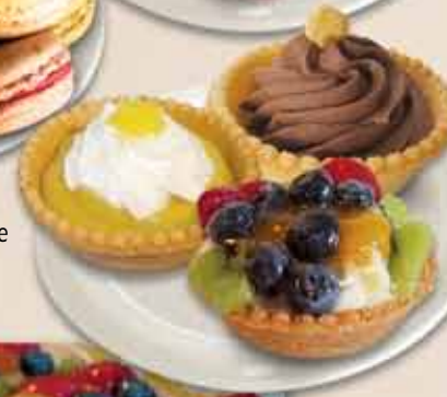
Lemon, Chocolate and Fruit Tartlets

Assorted Cookies Choose an assortment or let us create a custom tray for you. (Shown: Almond Horns, Kourabiedes, Snickerdoodle, Oatmeal Raisin, Coconut Macaroons, and Chocolate Chip.)