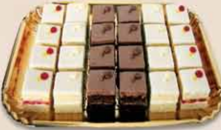
Petit Fours Tray

Opera Cake Tray Layers of almond cake, mocha buttercream and chocolate ganache. A most elegant choice! 18 ct. $46