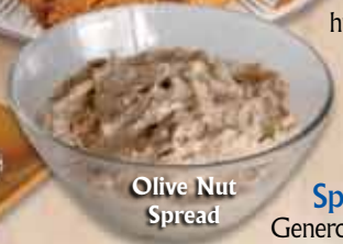
Olive Nut Spread