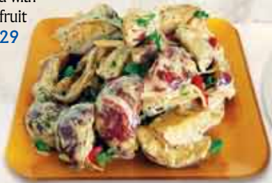
Roasted Red Potato Salad