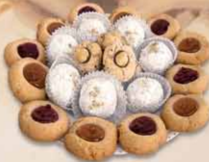
European Tea Cookies