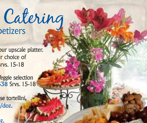
Cheese to Please Platter

Pepperdews Marinated pepperdew peppers filled with herbed cheese for a spicy sweet flavor. $20/doz.