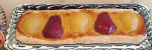
Pear Tart Kit

Linzertorte Miniatures Winter spices folded into a hazelnut crust, filled with apricot and raspberry preserves. $16/doz.