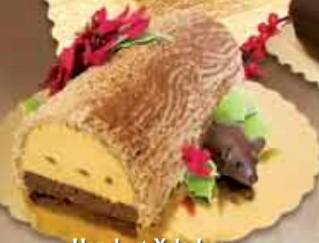
Hazelnut Yule Log

Hazelnut Yule Log A charming rumball mouse guards this classic European design featuring hazelnut & chocolate cakes, chocolate ganache and a subtly flavored mousse. $33 Serves 8