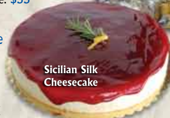
Sicilian Silk Cheesecake

Sicilian Silk Cheesecake Impastata cheese delivers a delicate flavor with a silky, smooth texture. A raspberry finish with a hint of orange zest accent this unique Sicilian whipped ricotta cheesecake. Lg. $39 Serves 14