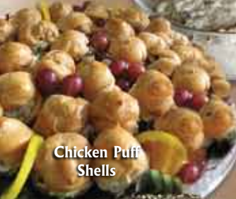
Chicken Puff Shells