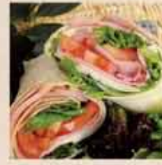
Ham & Cheese